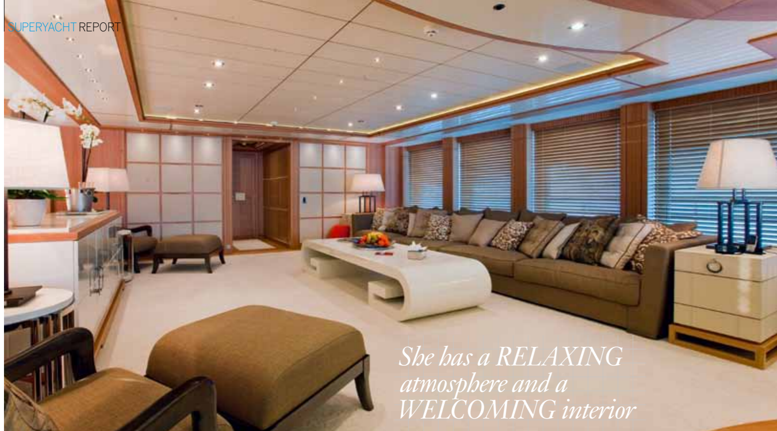
She has a RELAXING atmosphere and a WELCOMING interior

As well as the Far Eastern vibes, another source of inspiration is contemporary architecture – modern seaside villas and beach houses with large opening windows. You quickly forget anything that is purposeful and seaman-like in the lines. The yacht's exterior is an effective blend of glossy white bulkheads, acres of glass and shiny polished stainless steel railings. The large overhangs of the decks above create a modern and refreshing appearance, while the see-through glass bulwarks aft create an open feel, again blurring the distinction between out and in. Yogi has a very playful attitude to environments and spaces.