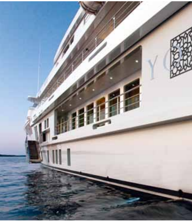
Above: What could have simply been slab sides are softened by decorative designs and overhangs. Right: The inside/outside main deck arrangement has the feel of a beach villa. Below: The custom main deck furniture means there is room here for all guests to gather for cocktails. Far right, below: Water cascades over the infinity pool on the main deck. Far right, top: The tricolour flies from the upper deck. The infinity pool's glass bottom allows daylight to reach the beach club.