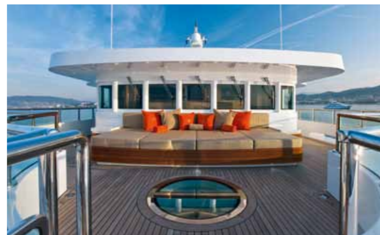
Above: Asian design influences abound through the yacht. The bridge deck salon has a Balinese feel and understated, elegant Japanese-style wall panels. Above right: Wide and spacious stairways and side decks ensure easy access to all areas. Right: The chunky sunpads immediately in front of the bridge are a great place from which to watch the yacht arrive into port. Facing page: Yogi's open deck spaces make her a wonderful yacht to explore.